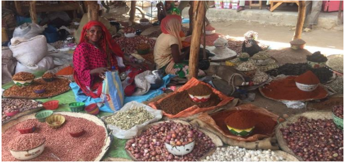
Small business initiatives. Batha Market

Resilience fund credits are mainly used to initiate or strengthen the livelihoods of Mothers' Club members.