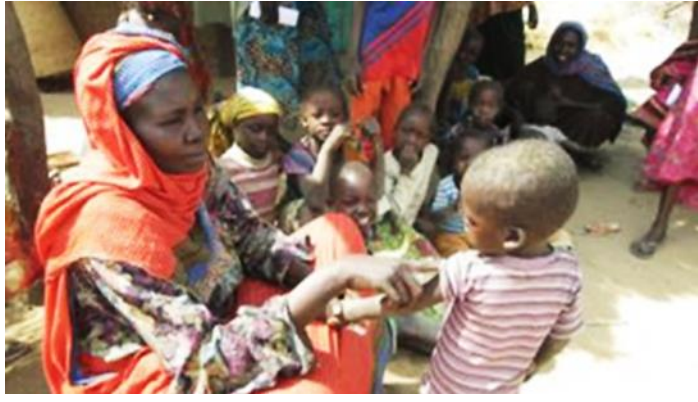
Screening children for malnutrition