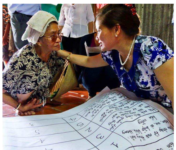
Vietnam Red Cross, A VNRC facilitator (right) explains livelihoods vulnerabilities to a village member. Mekong Adaptation and Resilience to Climate Change project.