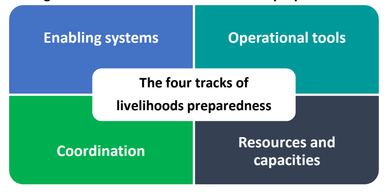
Figure 2: The four tracks of livelihoods preparedness

Effective capacity building and operational readiness efforts can be organized around the following four preparedness parallel tracks<sup>1</sup>: